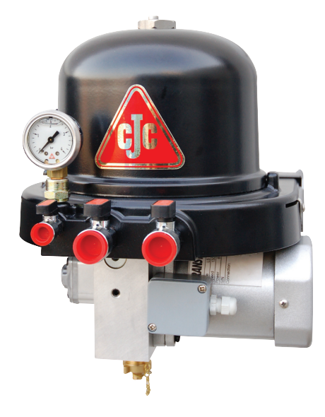
The CJC™ HDU 15/12 Compact Offline Oil Filter